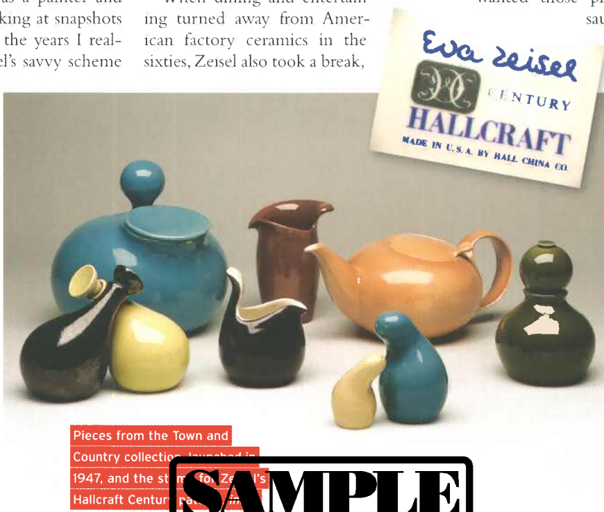
Pieces from the Town and Country collection, launched in 1947, and the story of Zeisel's Hallcraft Century partnership.

I offered him the china on long-term loan, until the appropriate moment came for my daughter to receive what our mother had shared with us. He accepted; it has served him well. So well that he's forgotten the deal we made. He says he loves me very much but can't imagine what I'm talking about. I'll just keep reminding him until his memory is joggled. I can't blame him. There is nothing like original Zeisel. My mother's Zeisel. ■