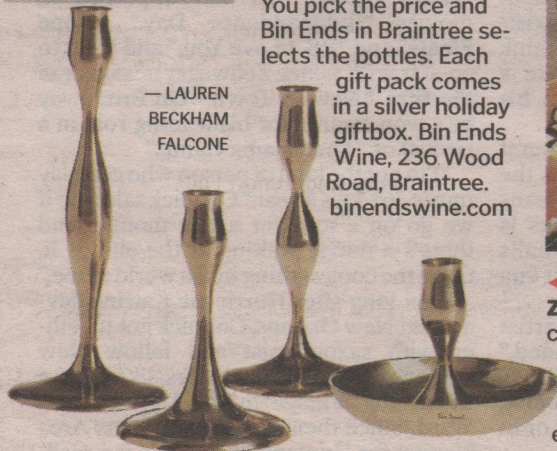
— LAUREN BECKHAM FALCONE

◀ Candlestick holders by Eva Zeisel are made using the ancient method of sand-casting with Eva's signature engraved into the base. From $65 to $250. Exclusively at evazeiseloriginals.com .